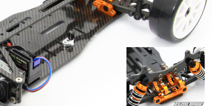
Body post for using the narrow roof body can be mounted on the rear side damper stay.

Please acknowledge that specifications may be changed without notice.